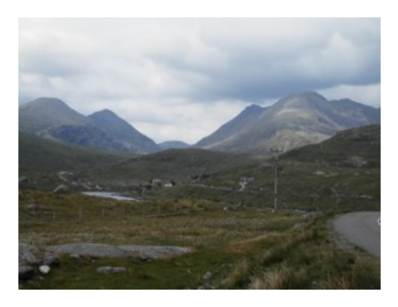
Day 5 Sun 10 June Balallan to Galson.

47 miles. Liurbost to Barabhas undulating.